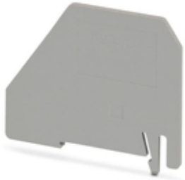
Partition plate, length: 65.3 mm, width: 2 mm, height: 60 mm, color: gray

Please be informed that the data shown in this PDF Document is generated from our Online Catalog. Please find the complete data in the user's documentation. Our General Terms of Use for Downloads are valid ( http://phoenixcontact.com/download )